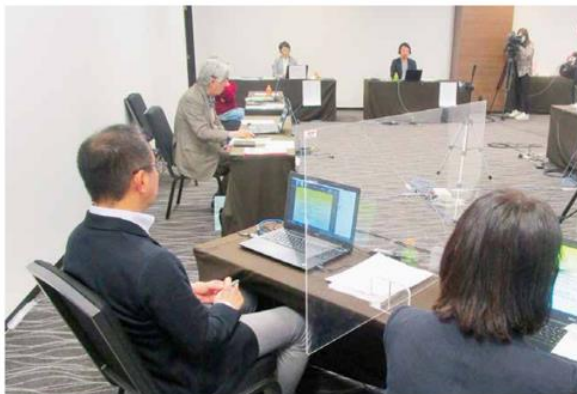
Forum photography venue

COVID-19 is expected to continue for the time being. Many projects, such as salon activities, were limited in FY2020 due to COVID-19; however, as we accumulated knowledge on project implementation in COVID-19, we gradually moved toward resuming these projects. We believe that there is a need to continue maintaining important venues and connections for disaster-affected areas with sufficient consideration and innovations.